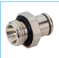
Straight Fittings - Quick Connect Style