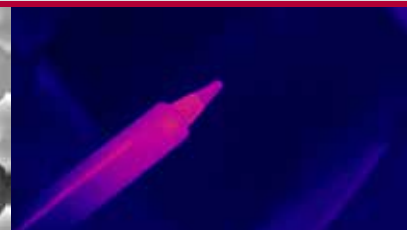
⌘ OCT: cross-sections MEMS