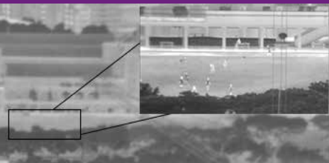
Long range surveillance