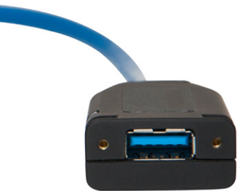
Locking USB Receptacle